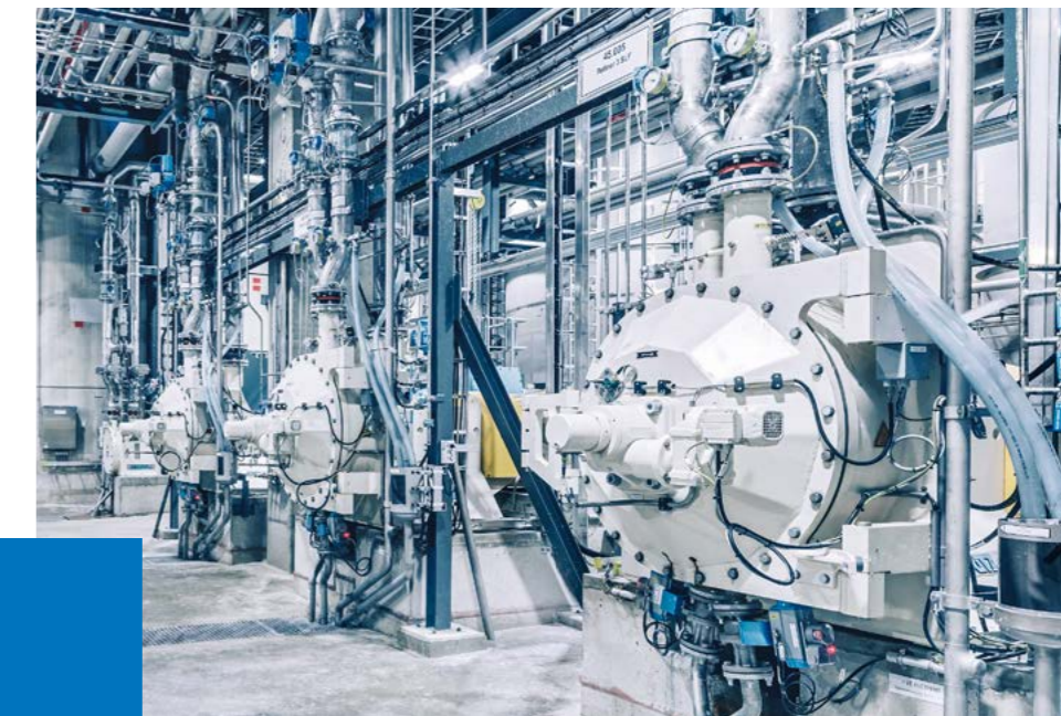
Five TwinFlo disc refiners enable smooth and efficient refining.