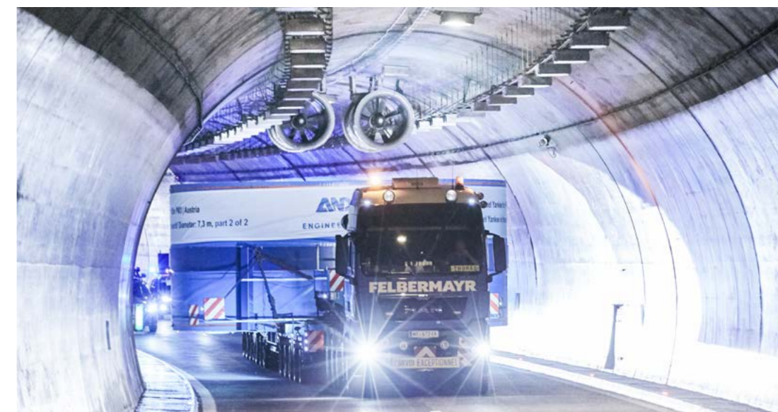
Based on the unique ANDRITZ engineering and logistics concept, the Yankee was transported in two halves and assembled on site.