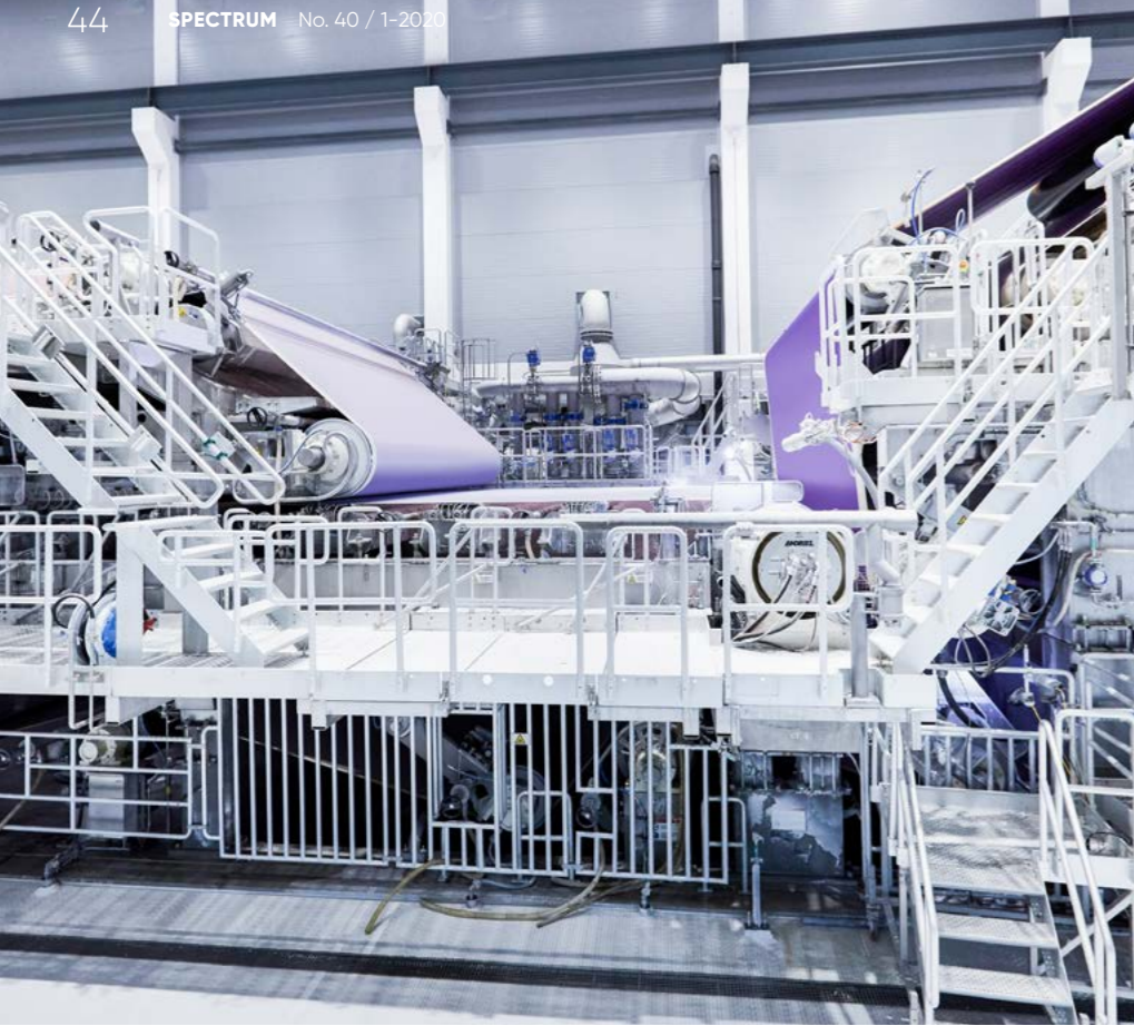
The forming section is equipped with a hybrid former.