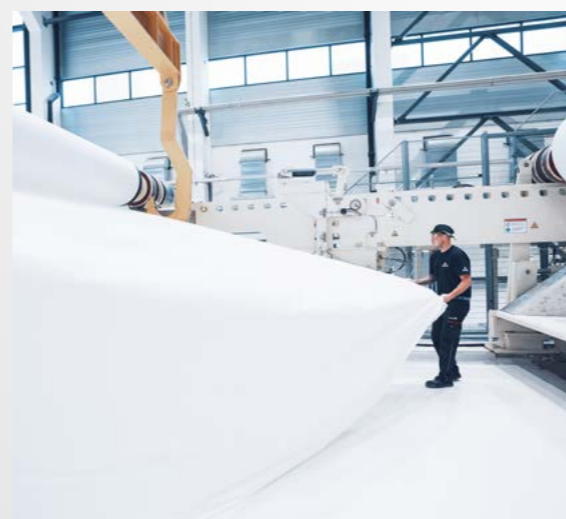
PrimeForm SW Fourdrinier former

“The good water circuit separation between pulp mill and paper machines is highly important as a shared water circulation could lead to problems. The system has been running without issues since the start and meets our expectations!”