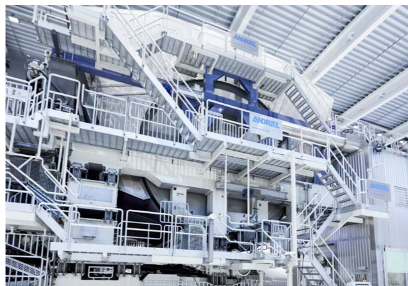
The 24 ft MG steel Yankee is the largest of its kind worldwide.