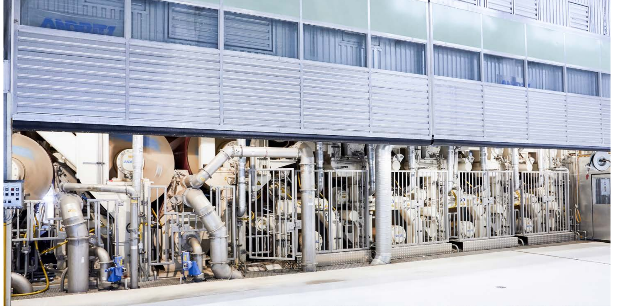
Pre- and after drying section features steel cylinders for efficient heat transfer and web stabilizers for a stable paper run.